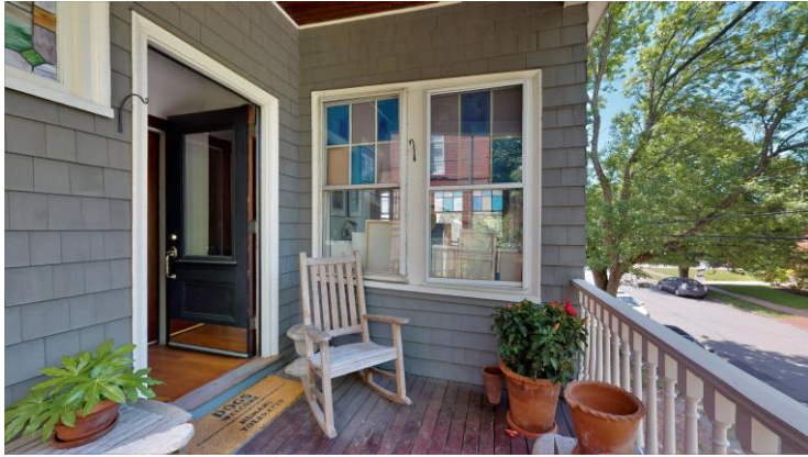
2 ND FLOOR PRIVATE COVERED PORCH FOR 3 RD FLOOR APARTMENT