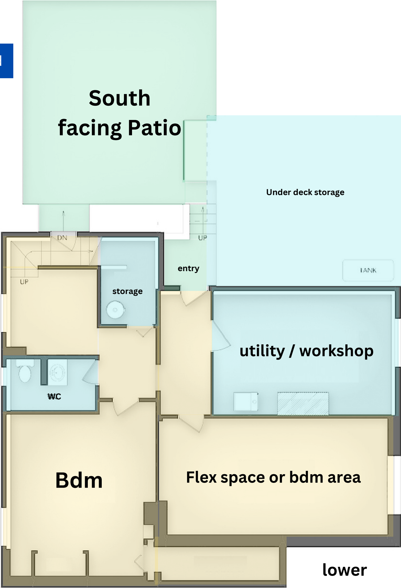
floor sketch overview illustration - verify all measurements if important